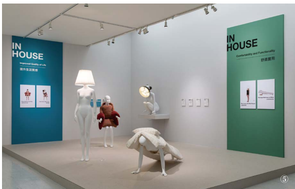
①《Dark Green Table Lamp (In-House)》2021 (Photo from 2021 performance in Taiwan) ②《Floor Lamp with White Pleated (In-House)》2021 ③《Classic Red Armrest Sofa (In-House)》2021 ④《Small stone fan》2023 ⑤「In-House」series(①Photographer: Huang Chang-Chih②③⑤ Provided by Taipei Fine Arts Museum④Provided by the artist)

Kirishima Open-Air Museum, Kagoshima Prefecture. Kirishima Lobby Project (Guest Artist from Asia)